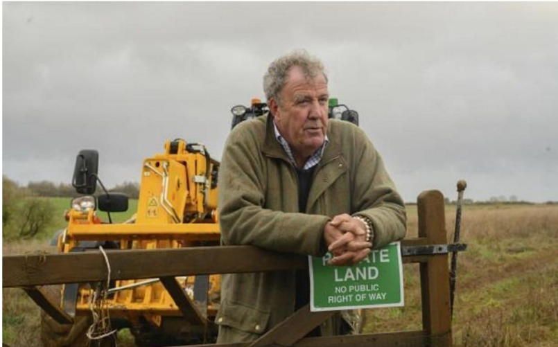
Jeremy Clarkson on Diddly Squat Farm.